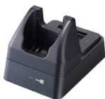
Charging and communication cradle