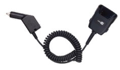
Snap-on car charger