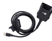
Snap-on cable (USB / RS232)