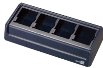
4-slot battery charger